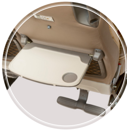
Adjustable footrest and tray

Observing the view ahead of you. Sitting back and enjoying the music of your choice. Losing yourself in thoughts and the moment. Being completely present; that is what it truly means to be a passenger.