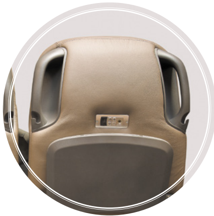
Personalized audio system

Observing the view ahead of you. Sitting back and enjoying the music of your choice. Losing yourself in thoughts and the moment. Being completely present; that is what it truly means to be a passenger.